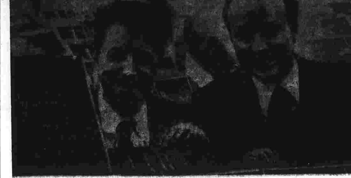
Nixon's Budget Caspar Weinberger, left, director of the Office of Management and Budget, who has been named Secretary of Health, Education and Welfare, and Roy Ash, director designate of the OMB, look over copies of the Nixon budget for fiscal year 1974.